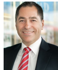
D&D - Commercial Sales and Marketing 02 9687 6555