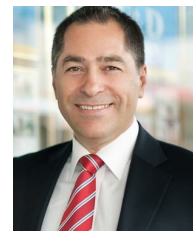
D&D - Commercial Sales and L 02 9687 6555